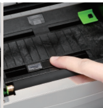
> Movable Reflective Sensor