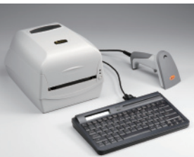
> Standalone mode with Argokee