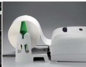
> External media stacker for 8.5" OD paper roll