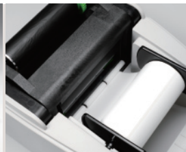
> Media Shaft Design for stabilizing paper