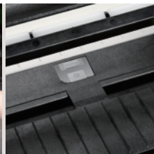
> Center Fixed Transmissive Sensor